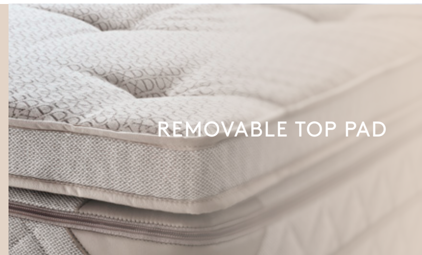
REMOVABLE TOP PAD

Our unique and unrivalled support system continues to allow customisation of the bed to an individuals' needs in not only weight and height, but in shoulder width, hip density and musculature. However, it has been enhanced by the addition of a 100% cotton carrier that ensures the cassettes remain in the desired place.