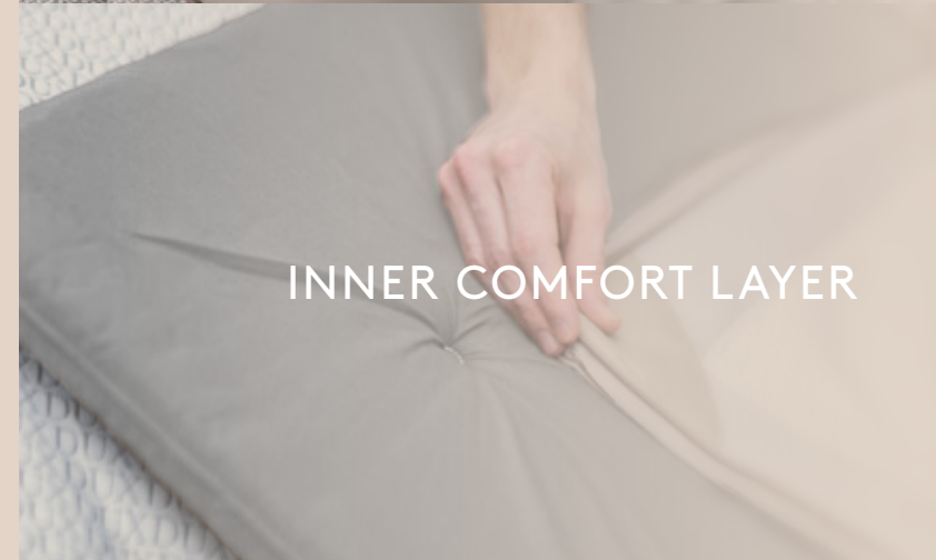
INNER COMFORT LAYER