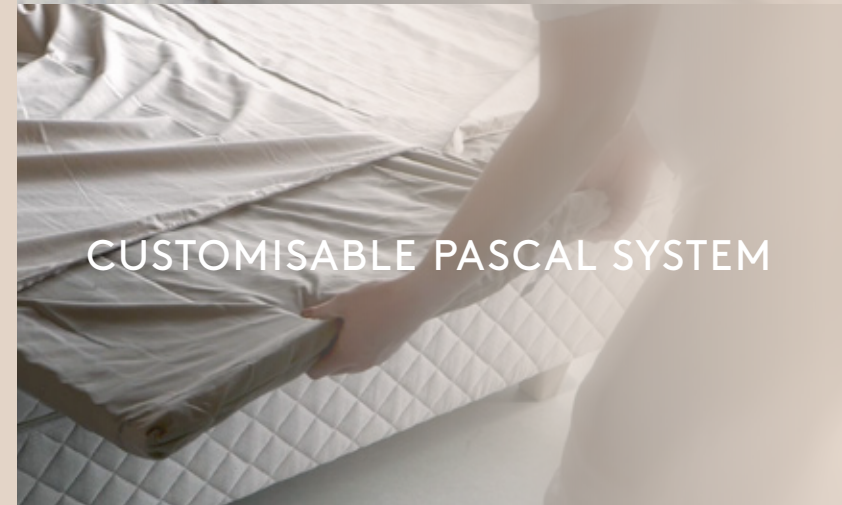
CUSTOMISABLE PASCAL SYSTEM